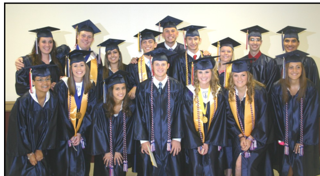
A snapshot of some of the BACS Class of 2010 at Graduation.