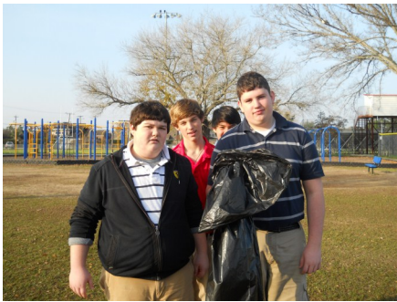
LTI students working together to serve in our Campus Connection Groups.

A team is a group of people working toward a common goal. We are all members of one team: the body of Christ. There are six main principles to be "ALL IN" on a team for Christ. We need to sacrifice some things to walk with the Lord. We need to be committed to serving God no matter what, and we need to have perseverance and hard work. We need to trust God like Noah trusted Him when building the ark. Lastly, we need to be passionate like Paul and Peter were passionate when serving the Lord. To be on a team, we all need to know where we're going and we need to get there together.