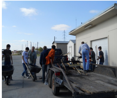
BACS' strong guys getting wheel-barrels, and showing off their muscles!!