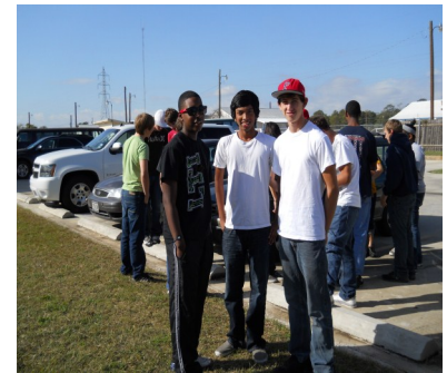
We stand as a team when we all work together.